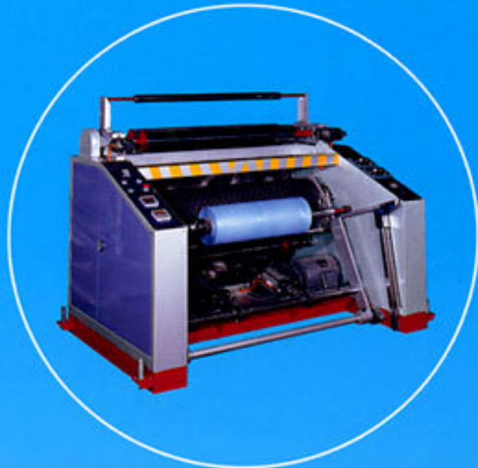
AUTO BOBBIN CHANGER